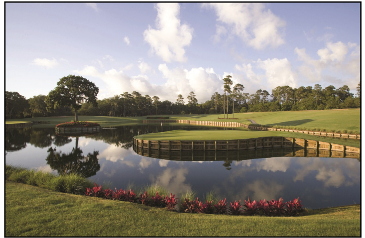
TPC Sawgrass – THE PLAYERS Stadium Course